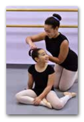
Dance Friends Make the Best Friends