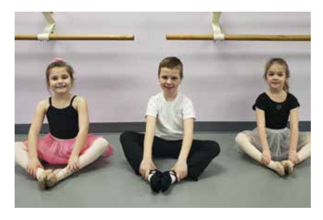
Studio '91 provides personal instruction for all learning abilities and personalities in our dance family. Dress code is observed to allow instructors to observe proper dance forms.